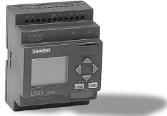
The programmable logic module is the brain of the MVP line of control panels

Orenco's MVP line of control panels is specifically engineered for demand and timed dosing of onsite wastewater and water treatment systems and is especially suited for applications that require a programmable timer. The MVP Duplex Panels are ideal for timed dosing in two-pump alternating systems.