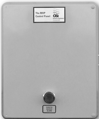
The enclosure is NEMA 4X rated